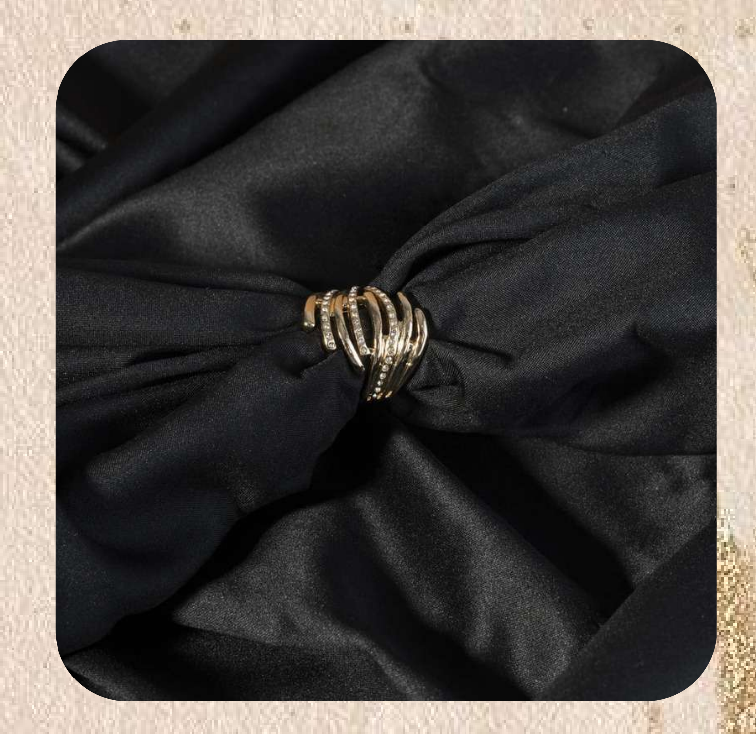
Worry-free wear, come rain or shine