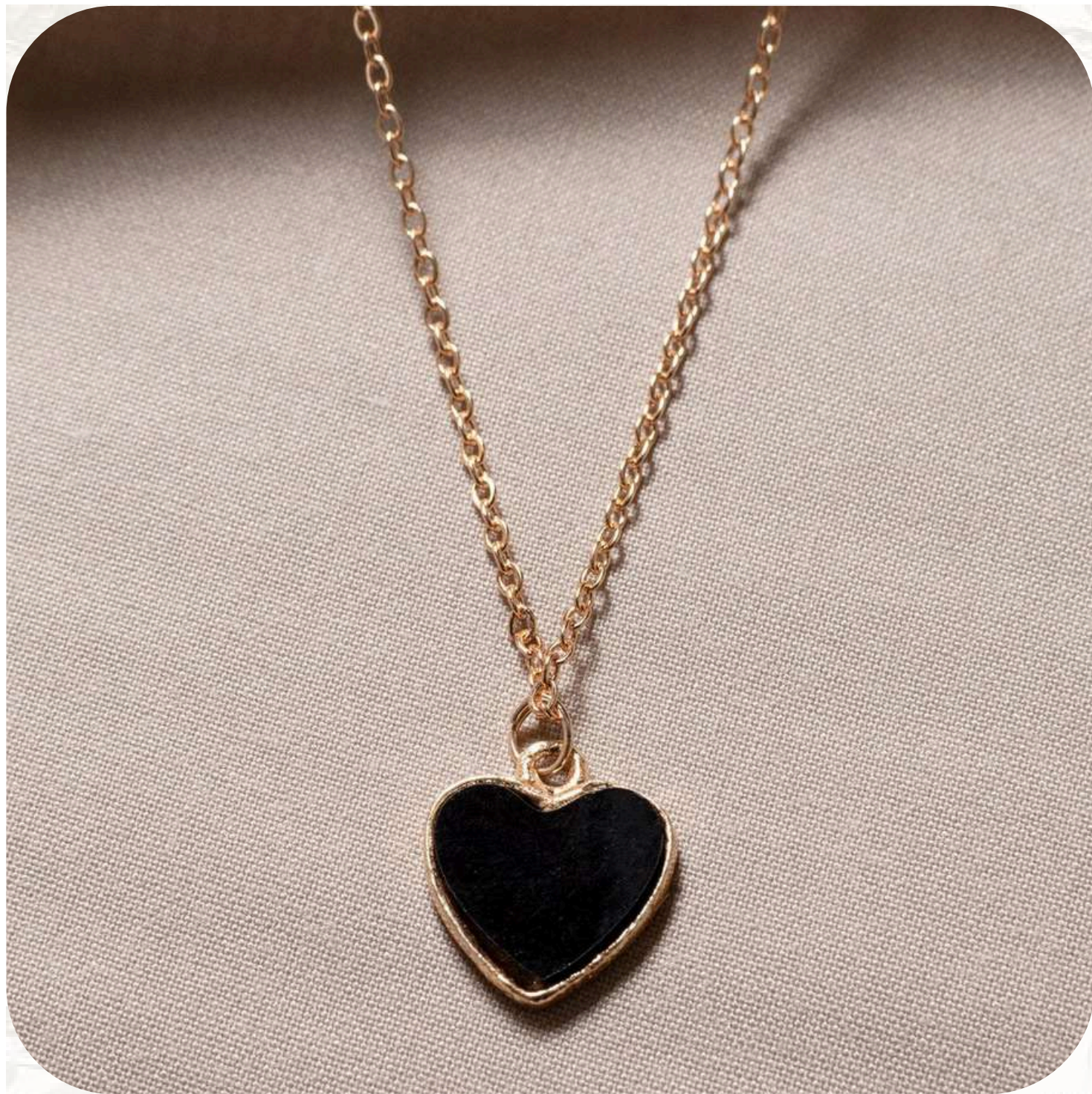
A piece of history, forever shining