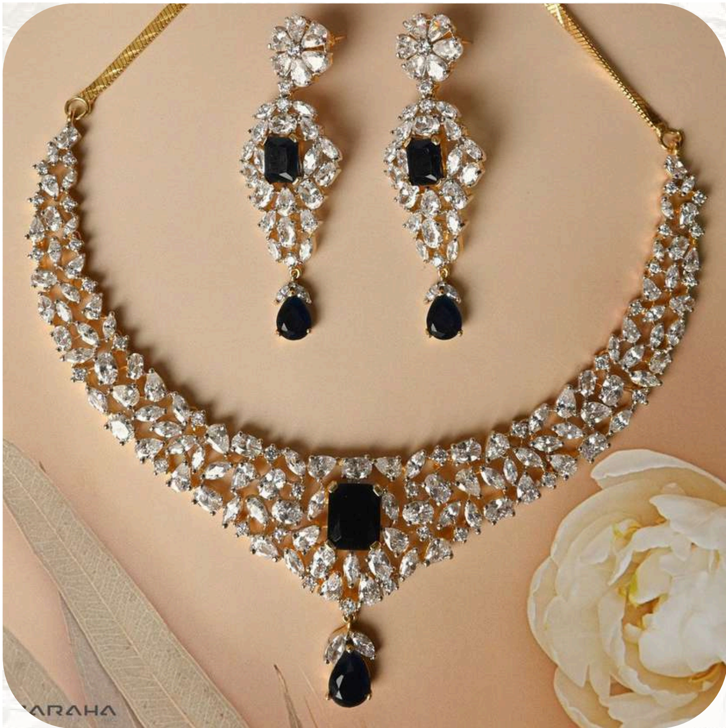
Intricate designs showcasing craftsmanship

Chunky stone pieces are perfect for making a chic, modern statement.