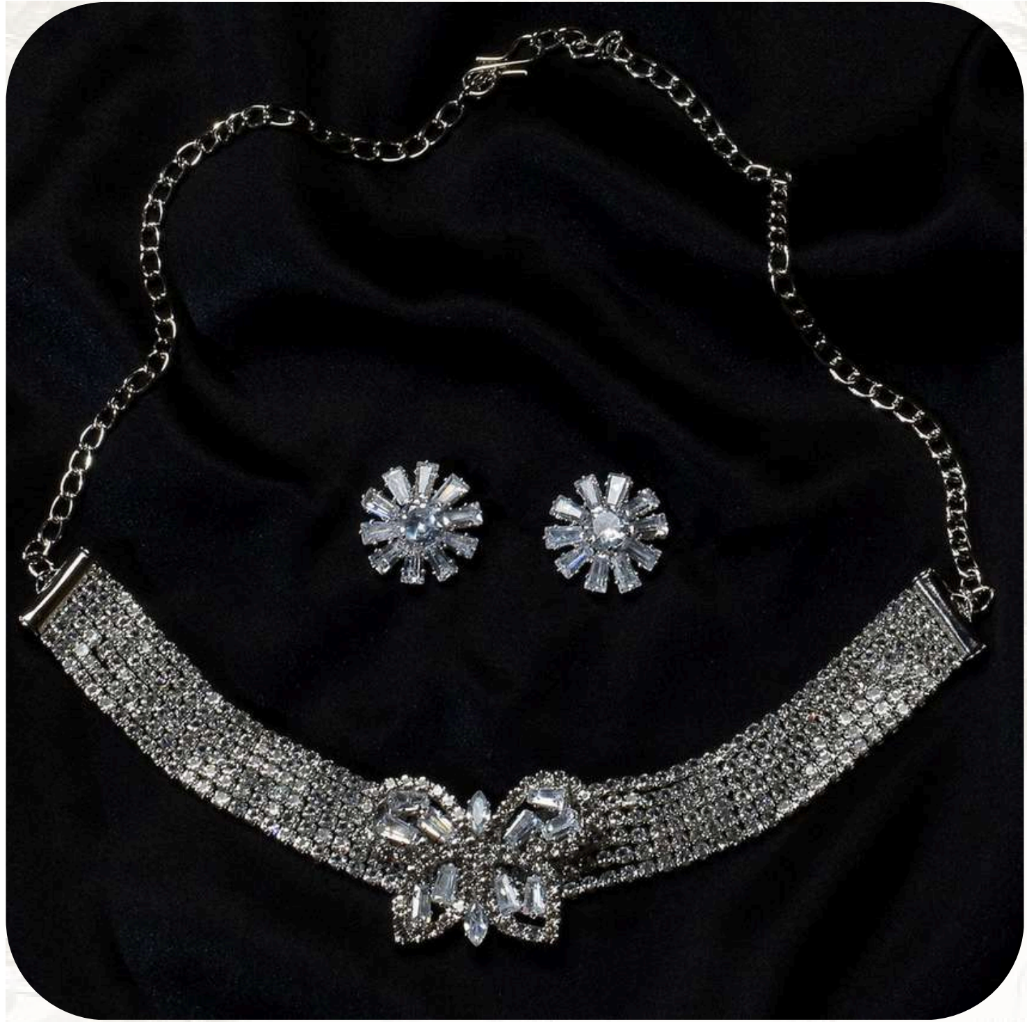
Chic and versatile for stylish looks

Intricate designs in gold polish showcase exquisite craftsmanship