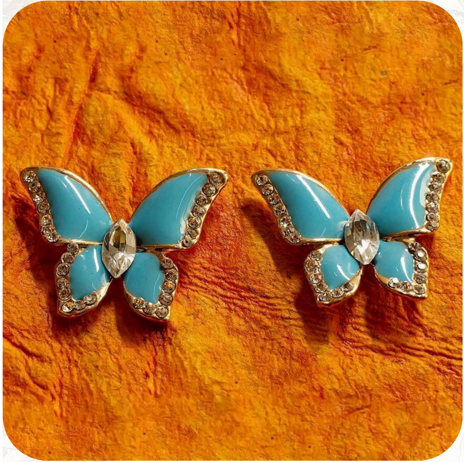
Delicate beauty that takes flight