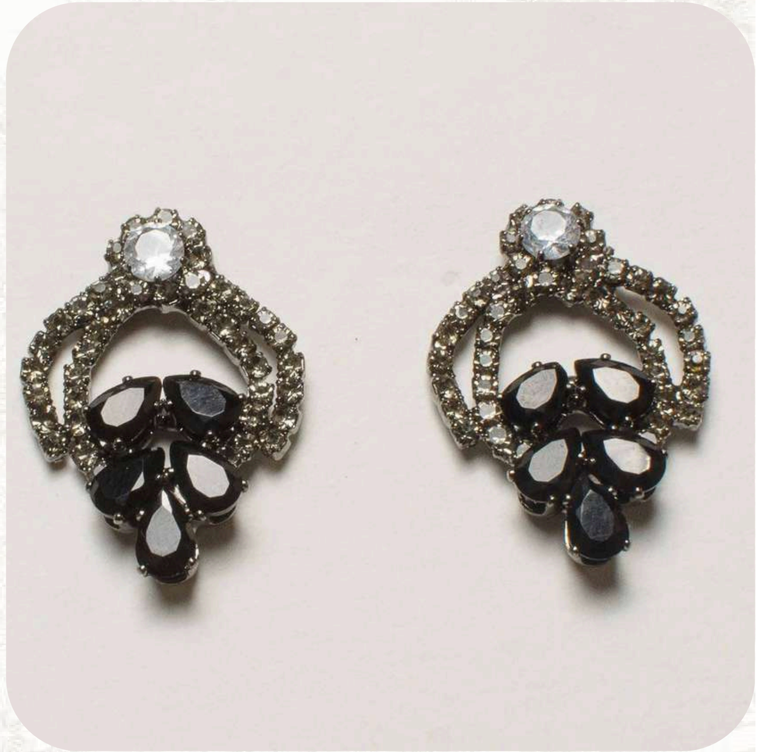
Dark stones, dazzling elegance