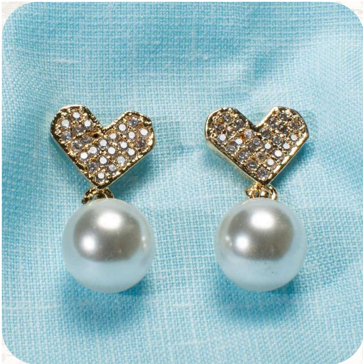
The essence of classic beauty