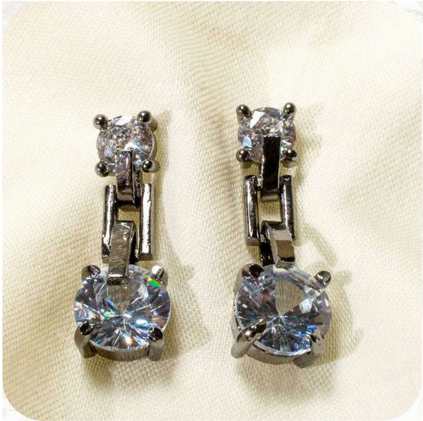
On-trend, on point