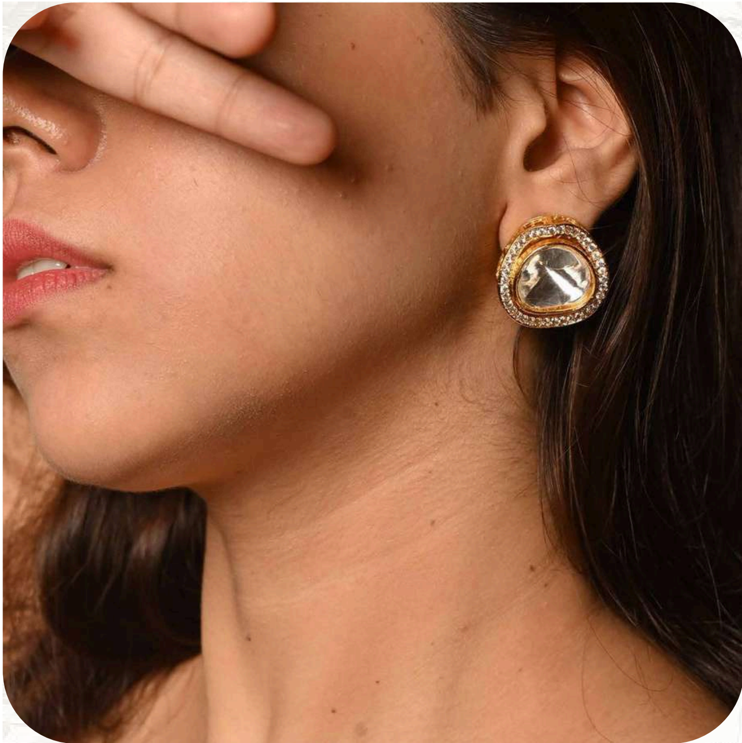
Anti-tarnish elegant earrings

Crafted stories in every tarnished curve