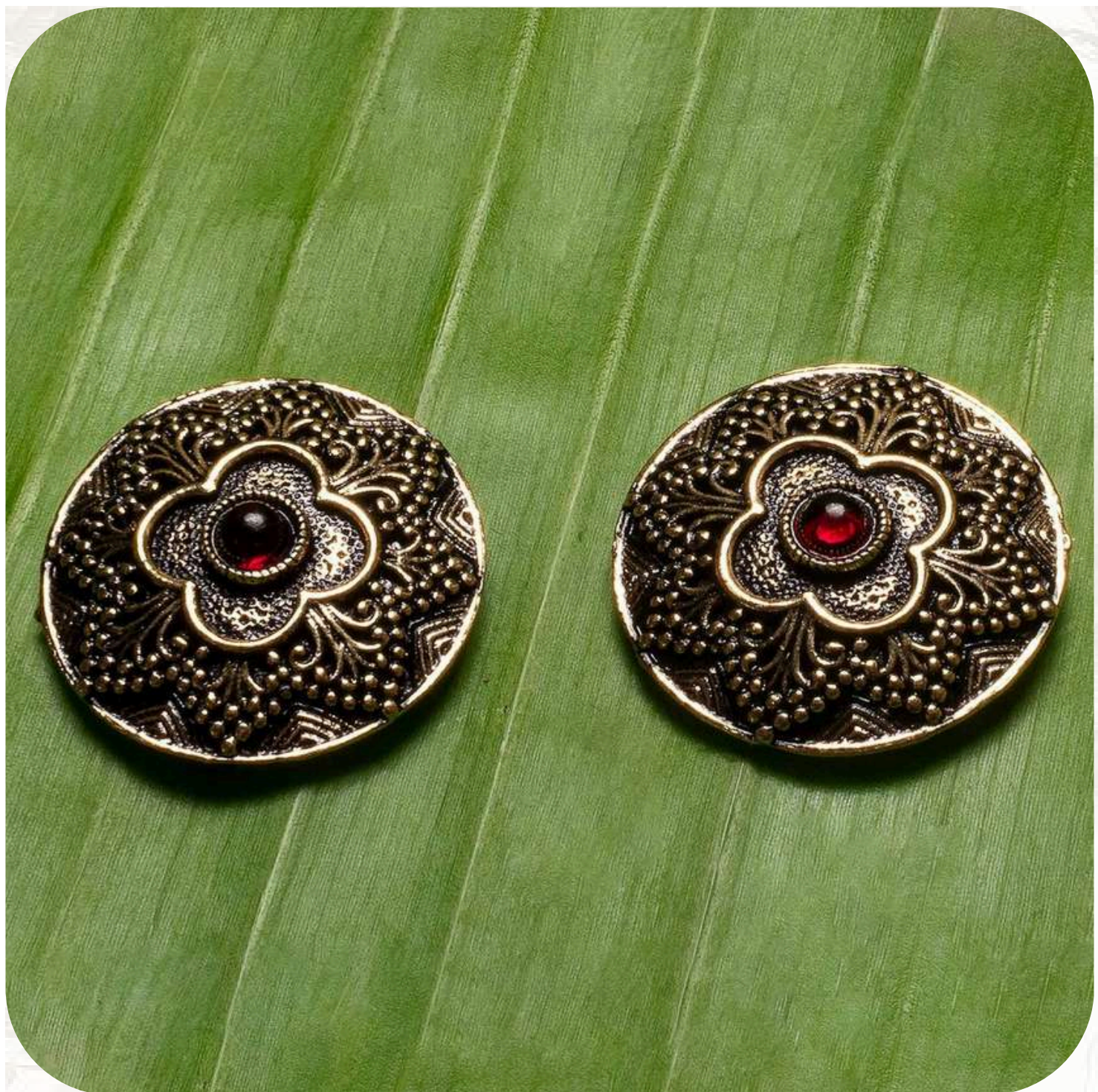
Dazzle in the dark