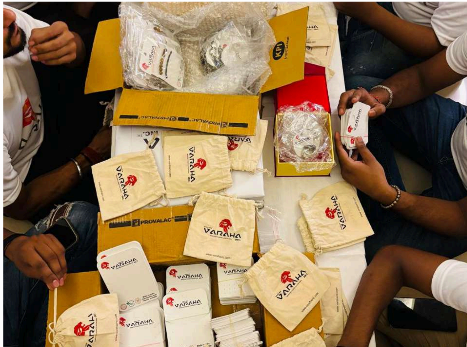
Watch the process unfold – click here