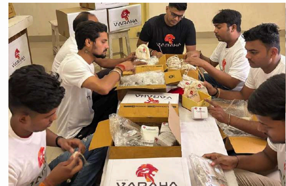
One Product at a Time