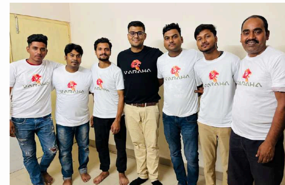
The Varaha Spirit