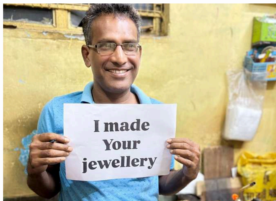
Built to Last