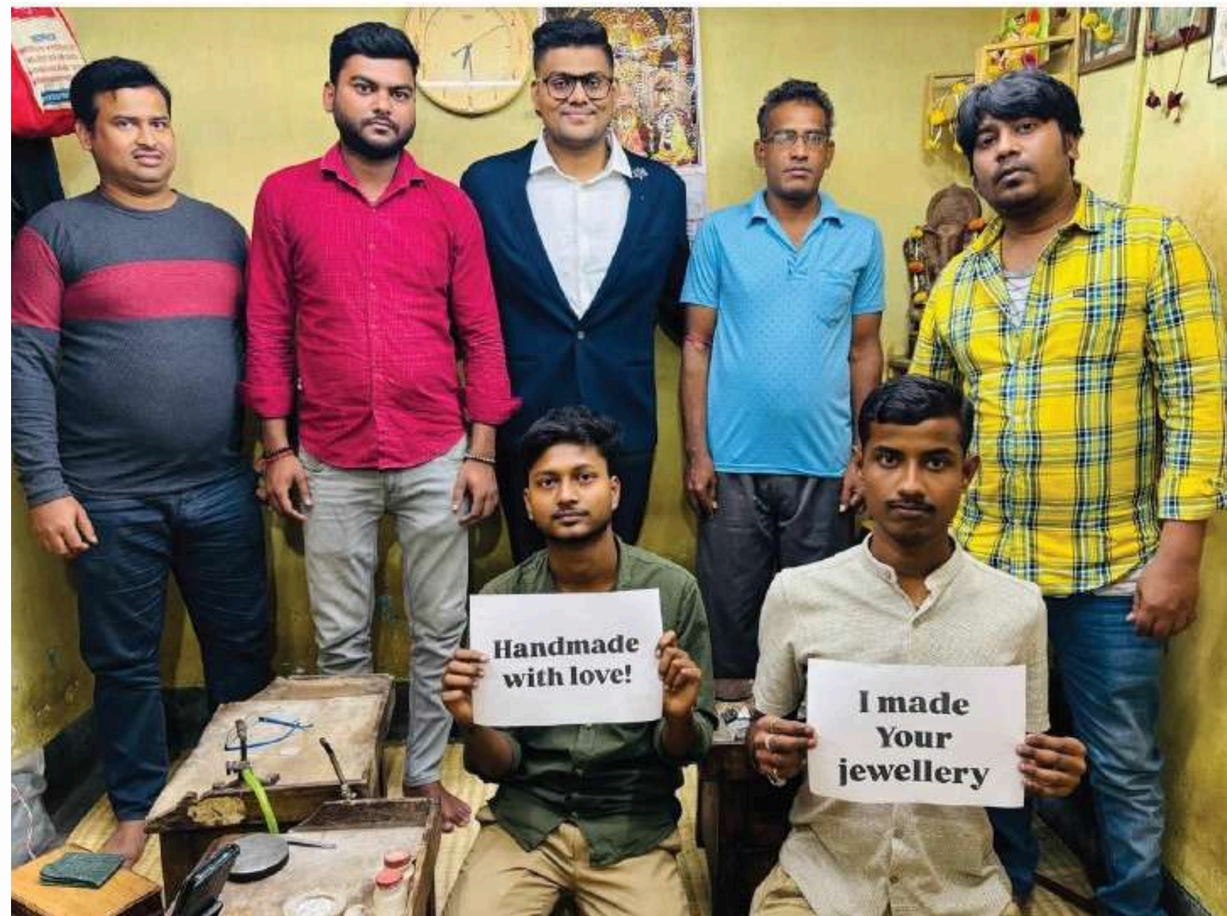
Beyond the Cubicle