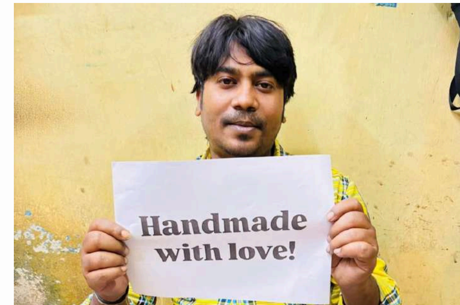
Made by Passion