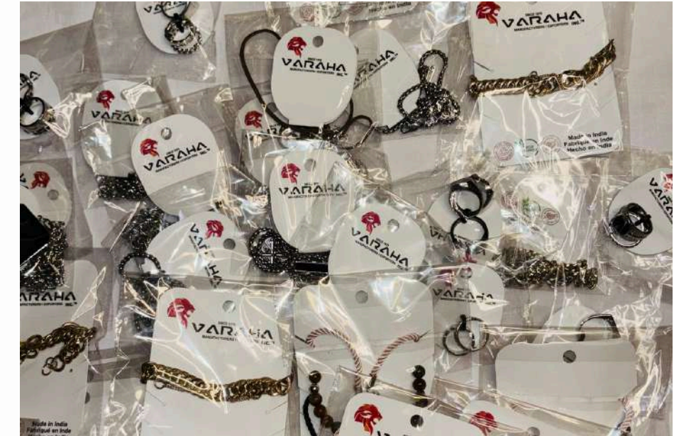
Wrap It Right