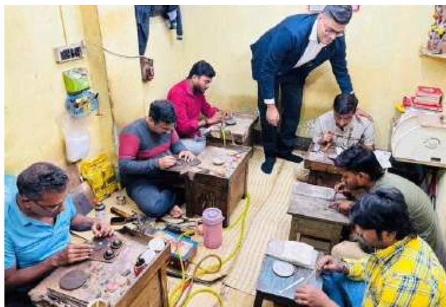
From Concept to Creation