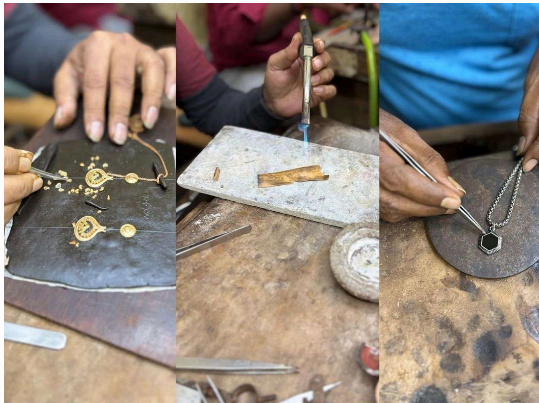
Crafting Tomorrow's Industry