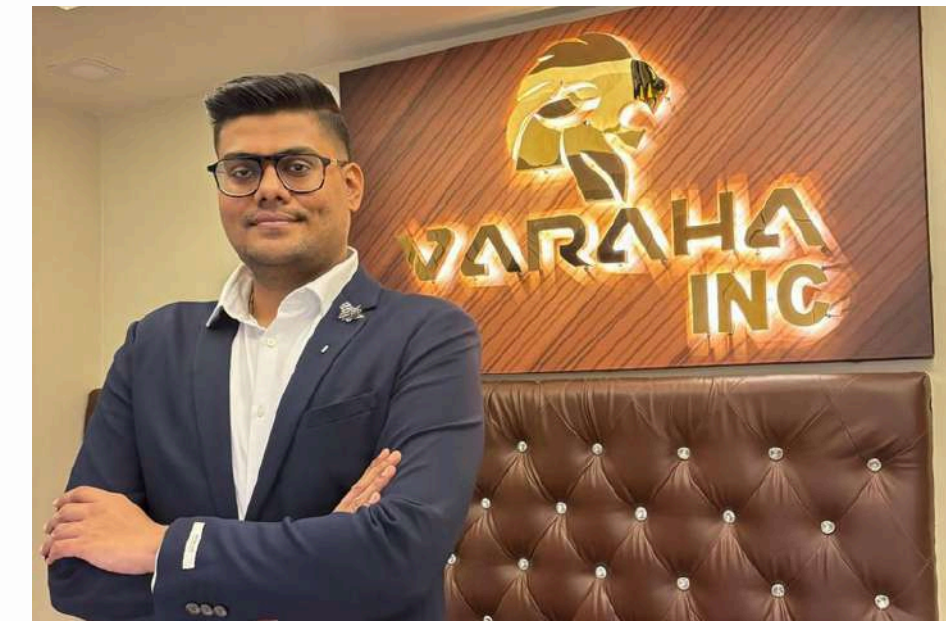
Where Ideas Grow