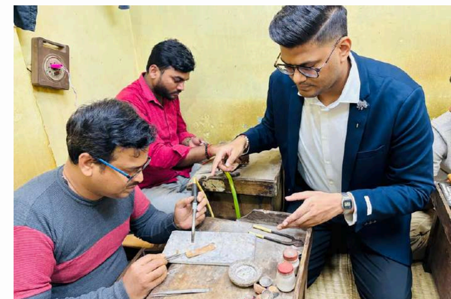
Strength in Every Detail